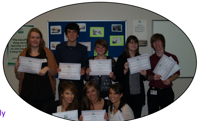
Some of the November Academy graduates

"We were incredibly impressed by the quality of presentations given by the Academy learners at their awards ceremony. They clearly put a great deal of effort into their preparation and delivery and the employers who attended were very proud of their employees. It was a wonderful ceremony and we are excited at the prospect of many more to come!"